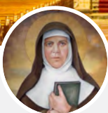
St Mary MacKillop