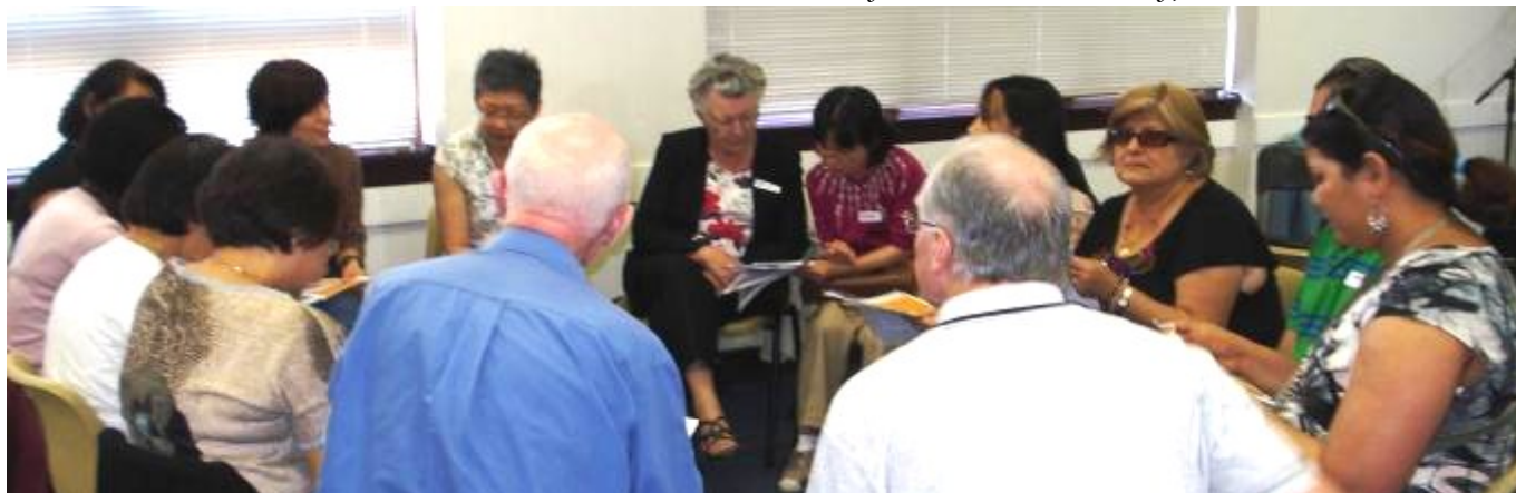
One of the discussion groups at our recent leadership day

T he theme for our recent Leadership Day: “ Coming Back to Praise and Worship ” was a response to the Prophetic Workshop organised by the National Service Committee (March, 2010). The purpose of this Workshop was to seek the Lord’s direction as to what he may be saying to us at this time in the Catholic Charismatic Renewal. Through a prophetic word, it was discerned that the Lord is calling us to renew our experiences of Praise and Worship. And so, at the Leadership day, we did just that, spending the first part of the day in Praise and Worship of our God. The participants were then posed certain questions to which the following are some responses. We believe it would benefit all Prayer Groups to reflect on these, that we might grow in the use of this wonderful gift given to the Renewal by the Holy Spirit.