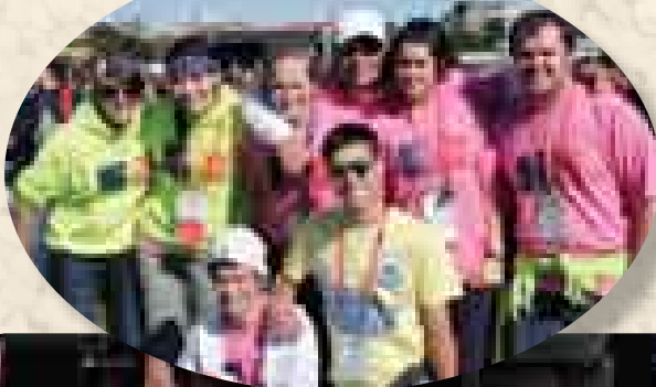
There is a buzz in our parish community.