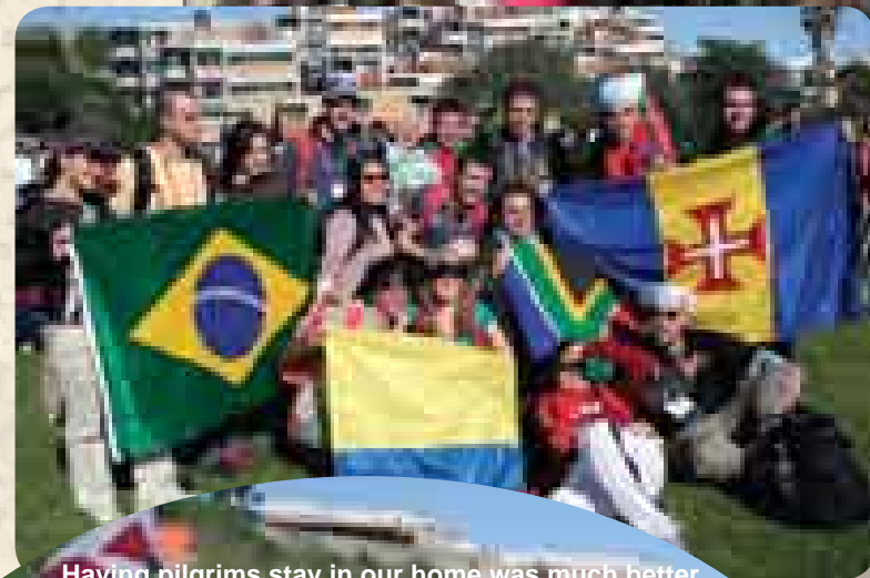
Having pilgrims stay in our home was much better than I thought – they turned out to be great people.