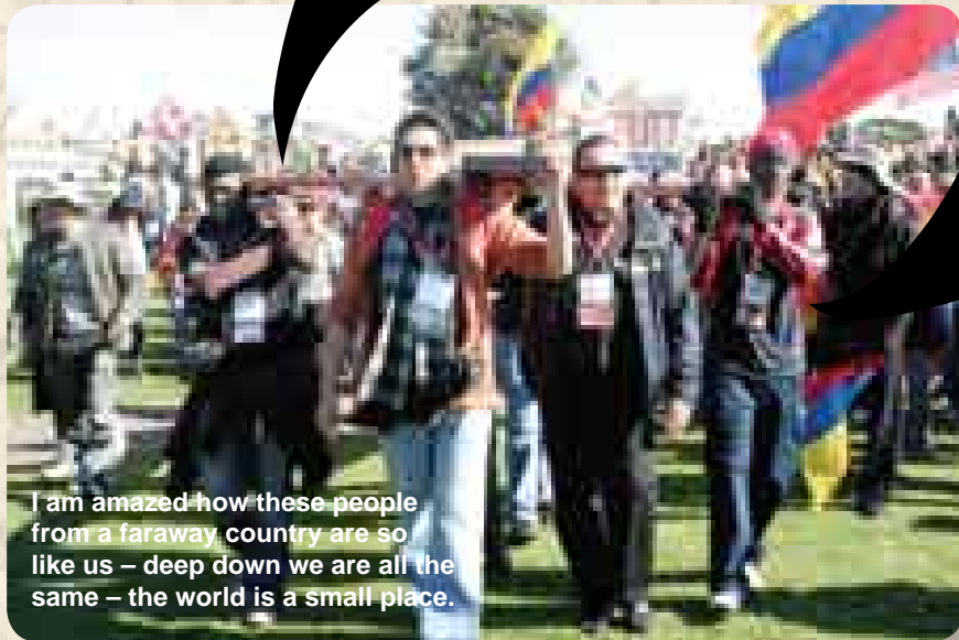
I am amazed how these people from a faraway country are so like us – deep down we are all the same – the world is a small place.