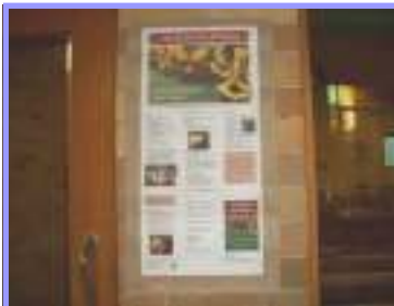
Invitation to Ministry display at St. Columba's Adamstown

Each faith community's catechists - Adamstown, Kotara and Cardiff, displayed their materials, leaflets, children's works, information etc. for the parishioners to